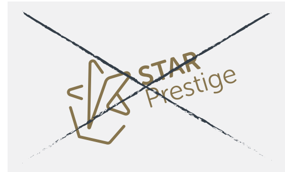
Don't rotate the logo.