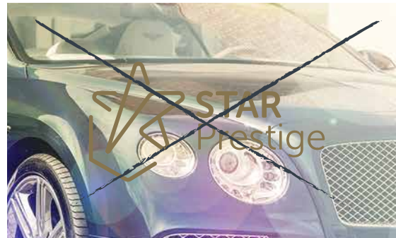
Don't place the logo on background images.