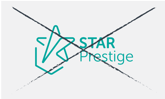
Don't change colour of the logo.